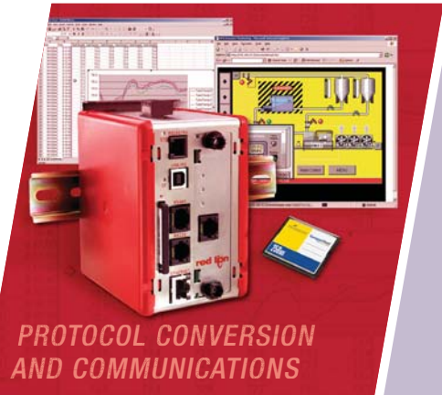
PROTOCOL CONVERSION AND COMMUNICATIONS