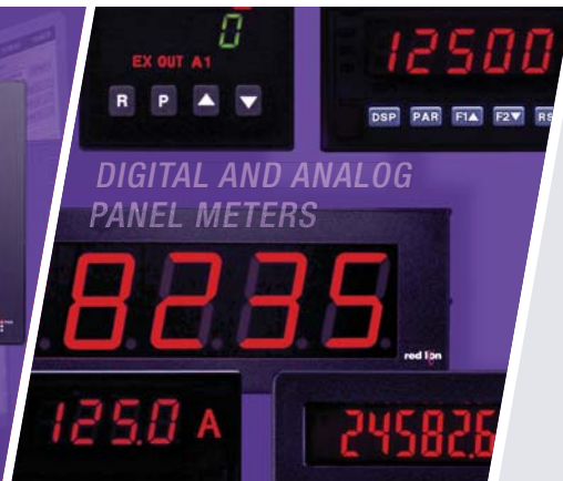
DIGITAL AND ANALOG PANEL METERS