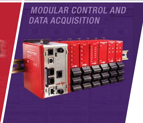
MODULAR CONTROL AND DATA ACQUISITION