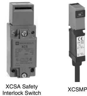
XCSA Safety Interlock Switch