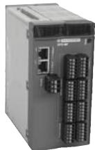
XPSMF Safety PLC