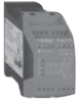
XPS Safety Relays

Many different safety architectures are available in Schneider Electric's product offering, from safety relays to safety PLCs. The safety architecture can determine what SIL level or safety category can be achieved with the safety solution. Various architectures may have inherent benefits such as simple selection or increased levels of diagnostics, but their cost effectiveness can depend on the size and complexity of the safety system and the features and functions required. Some of the features and benefits of these Various architectures are: