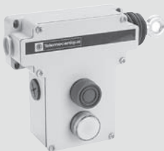
XY2 Cable Pull (p. 25-8)