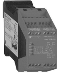
XPS Safety Relay

XPS safety relays monitor various safety inputs, start sequences, and feedback from starters and relays to allow machinery operation only when all safety controls are in their appropriate state and are functioning properly. Inputs can be from emergency stop push buttons, cable pull switches, limit switches, light curtains, safety interlock switches, or two hand control stations.