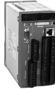
XPSMC Safety Controller

The XPSMC safety controllers can be used for monitoring all of the different safety tasks for your applications in one safety controller. All of the functions of the various safety relays are built into the hardware and software. The XPSMC safety controllers meet SIL 3 per IEC 61508, Category 4 per EN 954-1 and ISO 13849-1, and performance level “e” per ISO 13849-1. The associated configuration software makes development of the safety solution simple, using drag and drop techniques to configure the safety system. Detailed diagnostics provide an in depth overview of the status of the inputs and outputs.