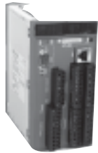
XPSMC Safety Controller