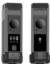
XUSLP Light Curtain