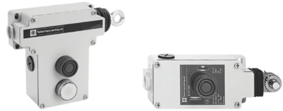
XY2 Cable Pulls