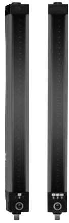
XUSLB and XUSLD Light Curtain

XUSL Type 4 light curtains provide point of operation protection for large areas without the need for gates or guards. They allow excellent visibility of the machine or process and free access to the machine while providing protection for personnel. Light curtains are made up of an array of infrared light beams to form a protected area. Whenever one or more of the light beams is broken, the light curtain sends a stop signal to the machine safety control circuit.