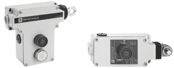
XY2 Cable Pulls