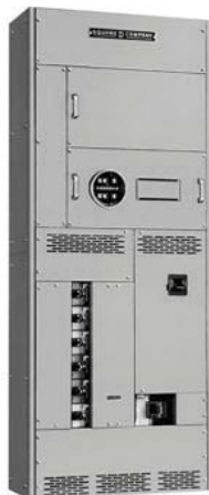
EUSERC UCT, Single Main Circuit Breaker with I-Line Distribution Panel