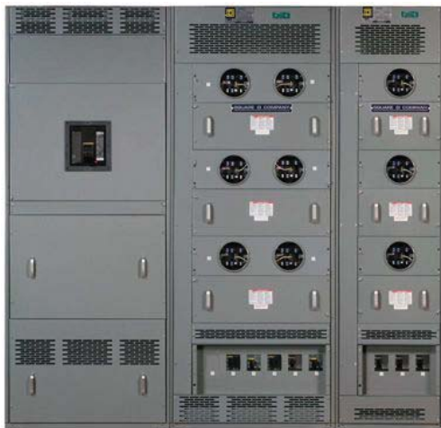
Power-Style™ Commercial Multi-Metering Switchboard Lineup