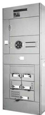
EUSERC UCT, Fusible Multiple Mains