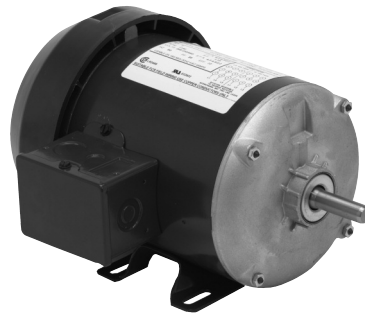
Totally Enclosed Fan Cooled Split Phase