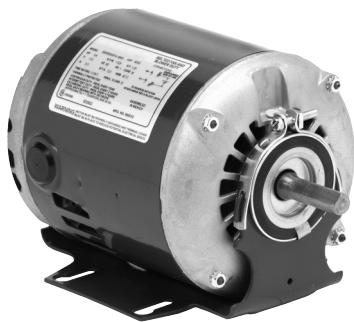
Open Dripproof Split Phase