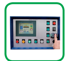
Mounting in enclosure