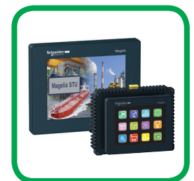
5.7" or 3.5" screens