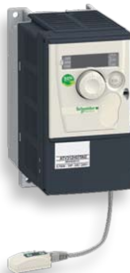
◀ Simple-loader allows you to quickly load the same configurations on several machines

Duplicate the configuration using Schneider Electric's simple loader and multi-loader, or the Altivar 312's bluetooth interface. The multi-loader stores configurations of several drives on a standard SD memory card and allows you to simply load it directly into your PC or drive. The simple loader maintains the settings of single drive for transfer.