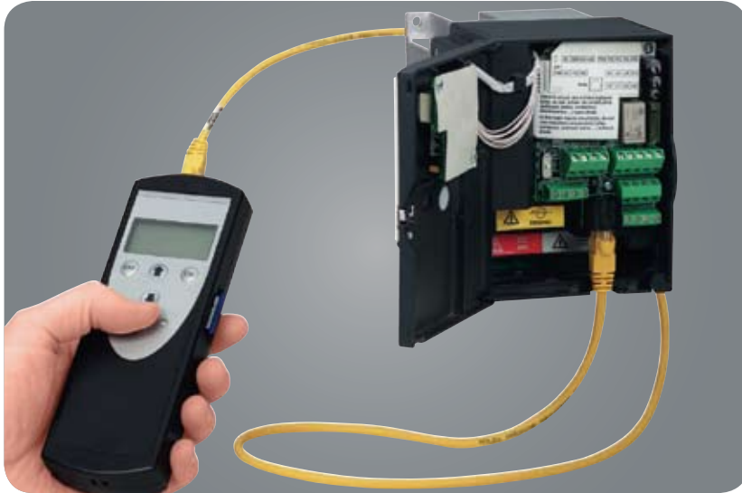
▲ Multiloader stores configurations for multiple drives