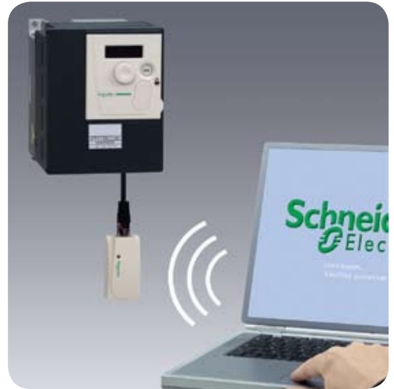
▲ Bluetooth compatible

The Altivar 312 drive integrates seamlessly into your architectures and communicates with all control system products to optimize machine performance. It offers numerous communications options, including Modbus and CANopen as well as option cards for CANopen Daisy Chain, DeviceNet and Profibus DP.