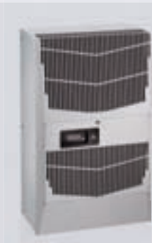
G28 Indoor/Outdoor 4000 & 6000 BTU/hr. 1172 & 1758 Watts