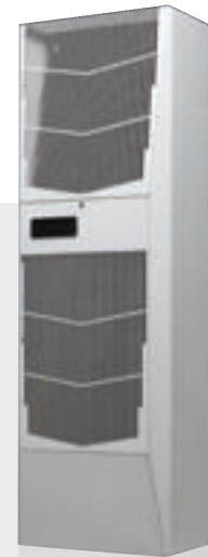
G57 Indoor/Outdoor 20000 BTU/Hr. 5900 Watts