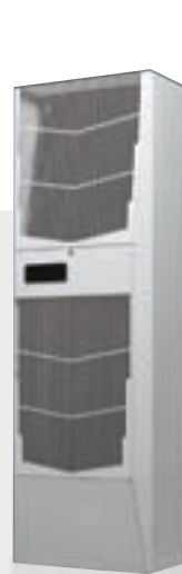
G52 Indoor/Outdoor 8000 & 12000 BTU/Hr. 2300 & 3500 Watts