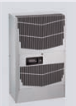
G28 Indoor/Outdoor 4000 & 6000 BTU/hr. 1172 & 1758 Watts