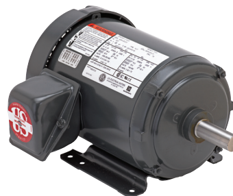
UNIMOUNT® Motors Footed