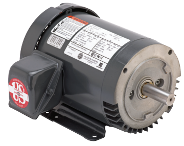
UNIMOUNT® Motors C-Face Footed