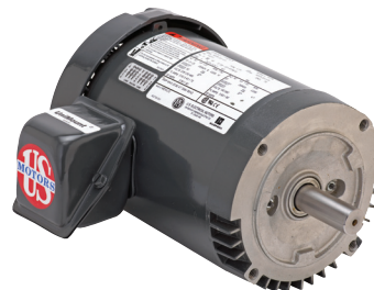
UNIMOUNT® Motors C-Face Footless